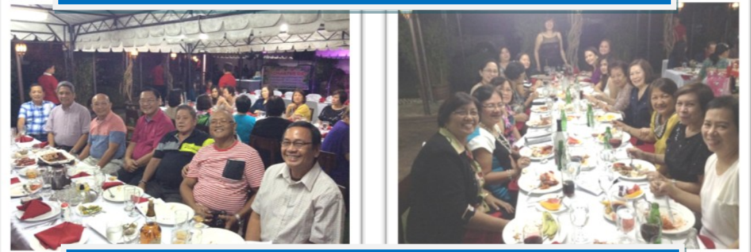
RCDS 38 th CHARTER ANNIVERSARY & CHRISTMAS PARTY ON DECEMBER 7, 2015